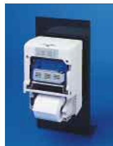
Wall Mount Option

Product Obsolescence Protection. The SP2000 Series can be easily upgraded to include autocutters and paper rewind mechanisms in addition to user changeable interfaces.