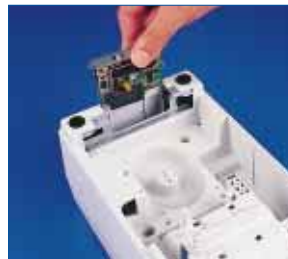
Plug-In Interface Cartridges